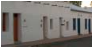
Scenes from Tucson's Barrio Histórico